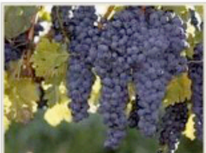
Many consider grape seed a powerful anti-aging ingredient.

In December, fashion and beauty juggernaut Christian Dior premiered its high end skincare line, L'Or de Vie , at Saks Fifth Avenue and Neiman Marcus stores throughout the country. Priced at $320 for the face cream and $350 for the extract, L'Or de Vie is publicized as one of the finest beauty products on the market. The secret? Sap from the saubignon grape vine.